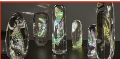
Light Field, 2017