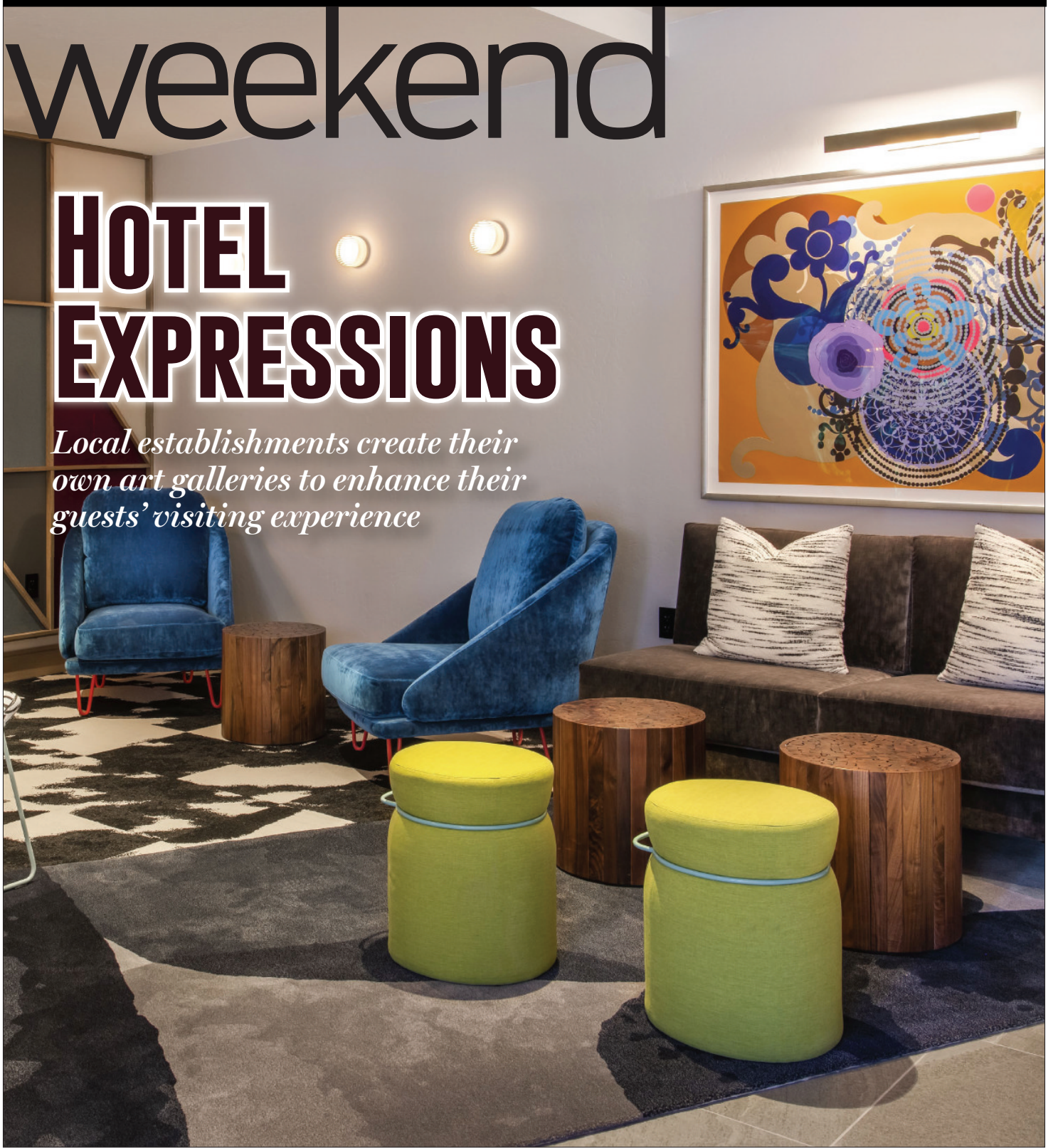
Artist Beatriz Milhazes's "Wild Grape" hanging in the meeting spaces of the Limeligh Hotel.

Local establishments create their own art galleries to enhance their guests' visiting experience