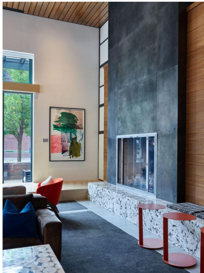
Robert Rauschenberg's signed print "Earth Day, 1990" hangs in the Limelight Hotel living room.