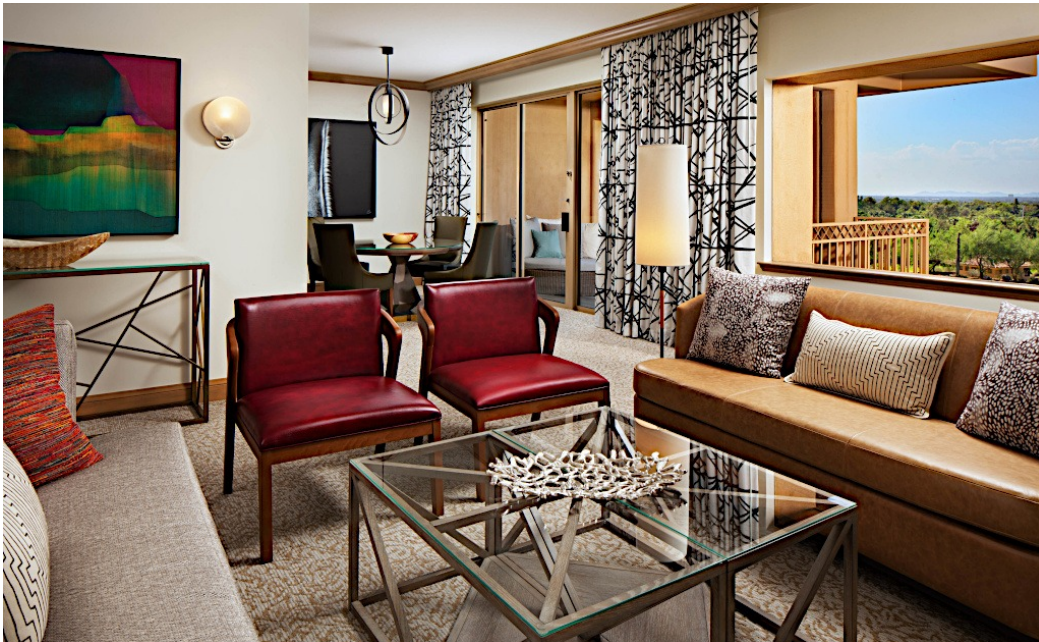
Canyon Suite at The Phoenician

have a very diverse and eclectic collection that ranges from antique toys, a couple of Chihuly's, Miro, and artists we collaborated with as well.