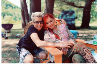
THE B52S' KATE PIERSON GOES CAMP (LITERALLY) July 24, 2020