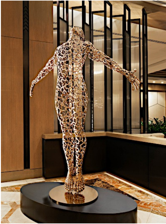
Solaris Sculpture at The Phoenician

have a very diverse and eclectic collection that ranges from antique toys, a couple of Chihuly's, Miro, and artists we collaborated with as well.