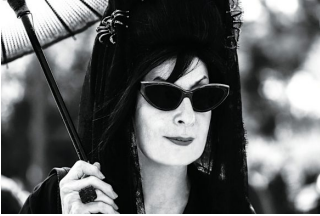
PASSPORT PROFILE: DIANE PERNET February 14, 2020