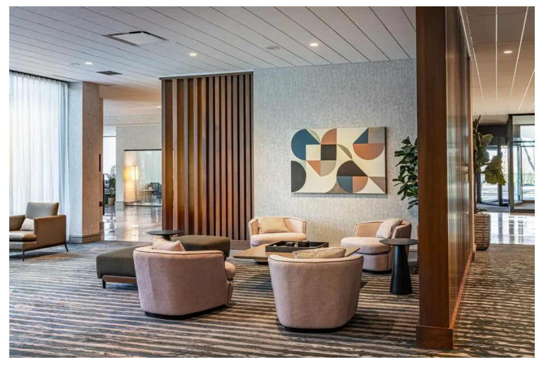
The design draws inspiration from the surrounding area. JOSEPH D. TRAN

unique design element of their own, ranging from authentic representation of Native American history to art programs that reflect cultural influences.