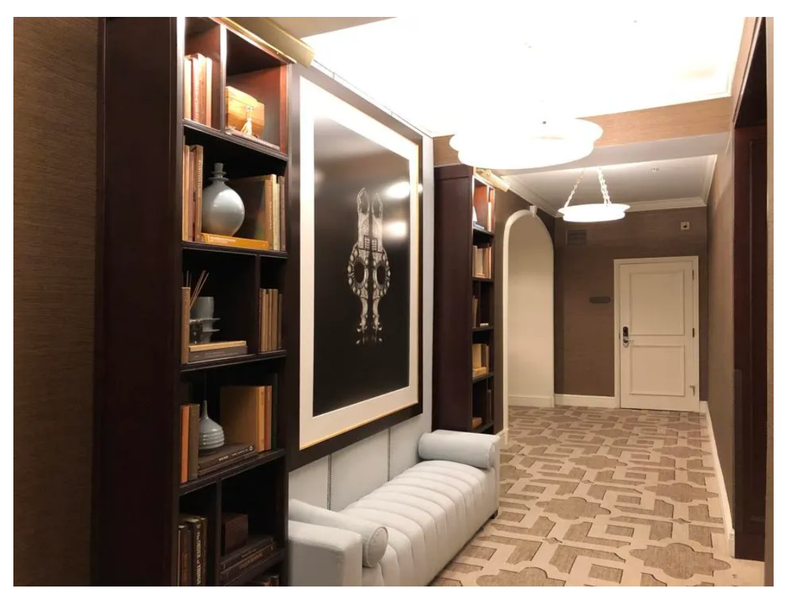
Built-in shelving adds to the residential ambiance of the hallways. ROSEWOOD MANSION ON TURTLE CREEK

separate strings, a nod to ancient Mayan architecture and Tulum's surroundings. The nature-inspired theme continues in the guestrooms with floor-to-ceiling windows for panoramic ocean views, hand-painted jaguar murals in each bathroom and organic elements such as stone, warm-toned wood and metal. Additional design firms include Ezequiel Farca , Paulina Moran and Esrawe .