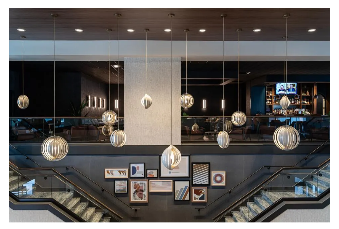
Unique design elements enhance hospitality projects. JOSEPH D. TRAN

Architect firms often incorporate a unique element when designing a major project for the hospitality industry. These can include massive atriums, bright color schemes in hotel rooms and creative spaces for business travelers. These recent projects each include a