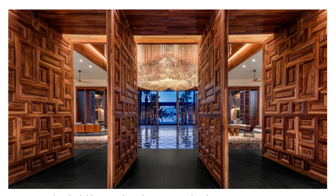
Guests entering the lobby pass through ornate wooden doors. CONRAD TULUM RIVIERA MAYA

tall, it is built on a man-made island off Dubai's coastline and has the world's tallest atrium, which ascends over 180m and is flanked by imposing golden columns. Architect Tom Wright of WS Atkins was the concept architect behind the Burj Al Arab, tasked with creating a ground-breaking superstructure that reflected the heritage and traditions of Dubai and Arabia. More than 30 different types of Statuario marble have been used in the walls and flooring throughout the hotel, and 1,790sqm of 24carat gold leaf was used to embellish the interior.