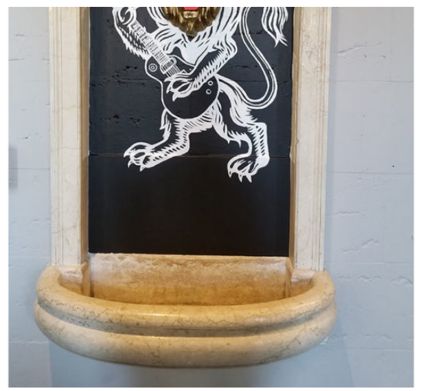
Holston House Nashville - Unbound Collection by Hyatt

Art of the Matter | InspireDesign Innovative vision for today's hotel